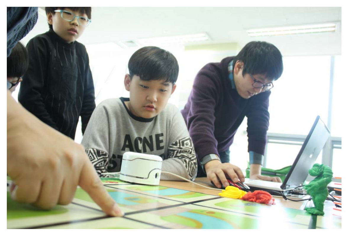
Students programming robots using C

succumbed to frustration and impatience; both common symptoms of working with this language. If you want to program devices or robots, you will probably find this language a compulsory requirement. In any case, those who master C will be the envy of those who don't know it. At least, I was envious.