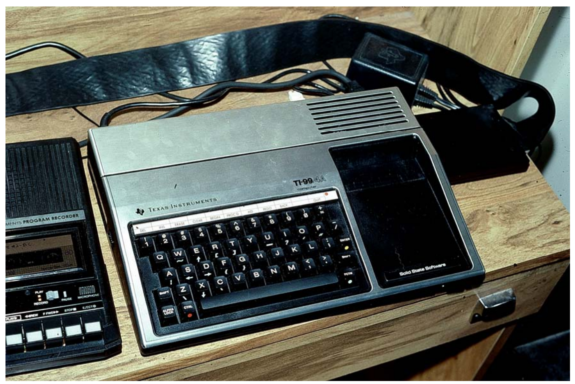
My old TI99/4A back in '83

I soon found out that, once you understand the logic of programming, you can quickly learn other high-level languages. This was the case when I was doing a school tour of the Digital Equipment Corporation hard disc plant back in Colorado Springs and then invited to do a little programming for them using another language called Pascal. I was freely-provided with a line modem to access their mainframes and bulletin board systems (BBS) which opened out a new vista of untapped resources which would be near-impossible to obtain at the local library. To this day, I still use Usenet services which kind of resembles the old BBS.